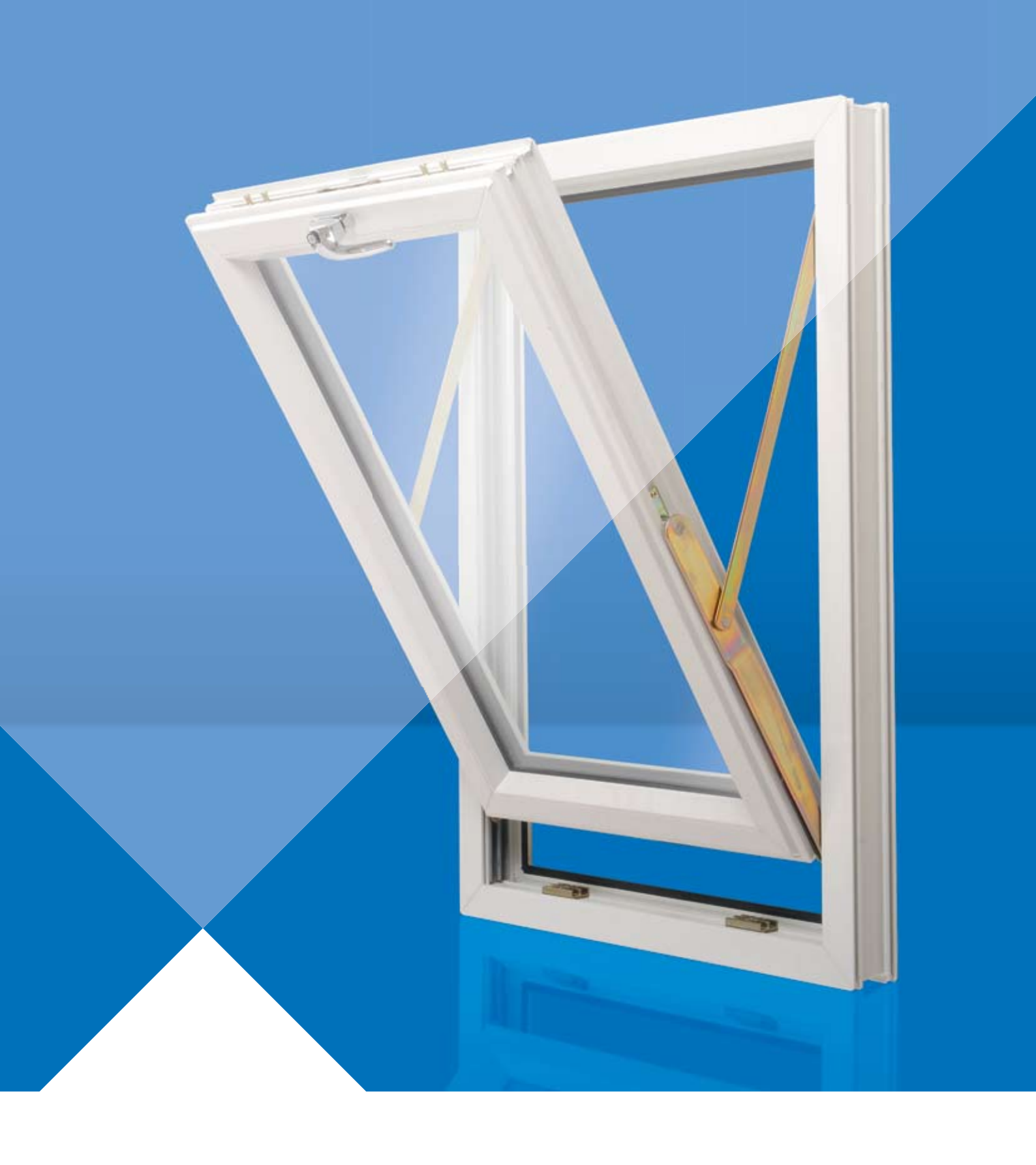
Fully Reversible Window System